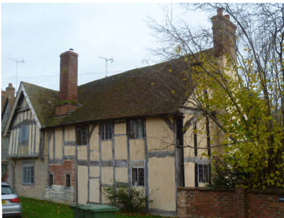
Fig. 1. Wisson Hill, Barton

Notes: Historic units of land area are: 1 acre = 4 rods; 1 rod = 40 perches; a yardland is a conventional unit of open-field property, probably equivalent to about 40 acre; the term ‘messuage’ refers to a house and usually the land immediately surrounding it. For a glossary and information about interpreting title deeds, see Alcock, 2017.