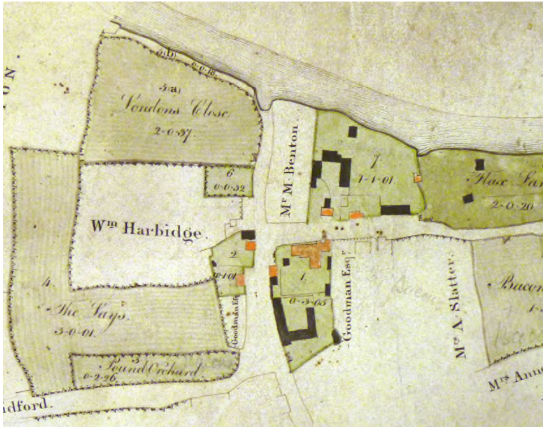
Fig. 3. Map of the property of John Slatter in Barton, 1815 (WCRO, CR 1596/Box 140/4).

The c. 1777 map confirms the location of Alice Hiller's house (5), next to the Manor House (7); the areas of (5) and (6+7) correspond well to those specified on the c. 1830 map. It shows a more complicated situation than appears later, with her also owning a second plot of land (4) surrounded by part of the land of Thomas Slatter, and also a small plot west of the Barton road (15). Plot 4 was presumably acquired by John or Thomas Slatter before 1830, when the map show just a single enclosure there.