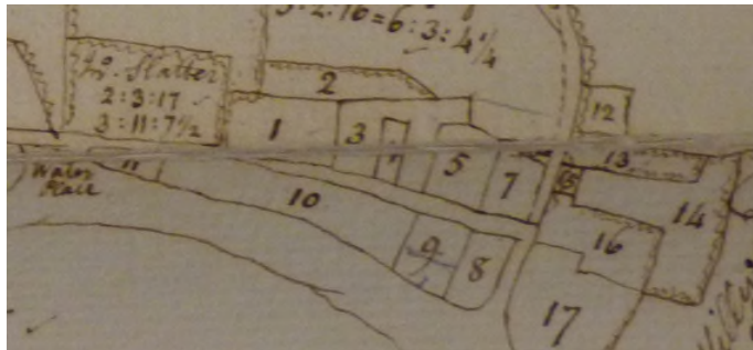
Fig. 2. Sketch map of Barton and Marlcliff in 1777 (SCLA, DR203/18): (a) detail of Barton village (N to bottom); (b) key; (c) c. 1830 map (part) (WCRO, CR797; N to top).